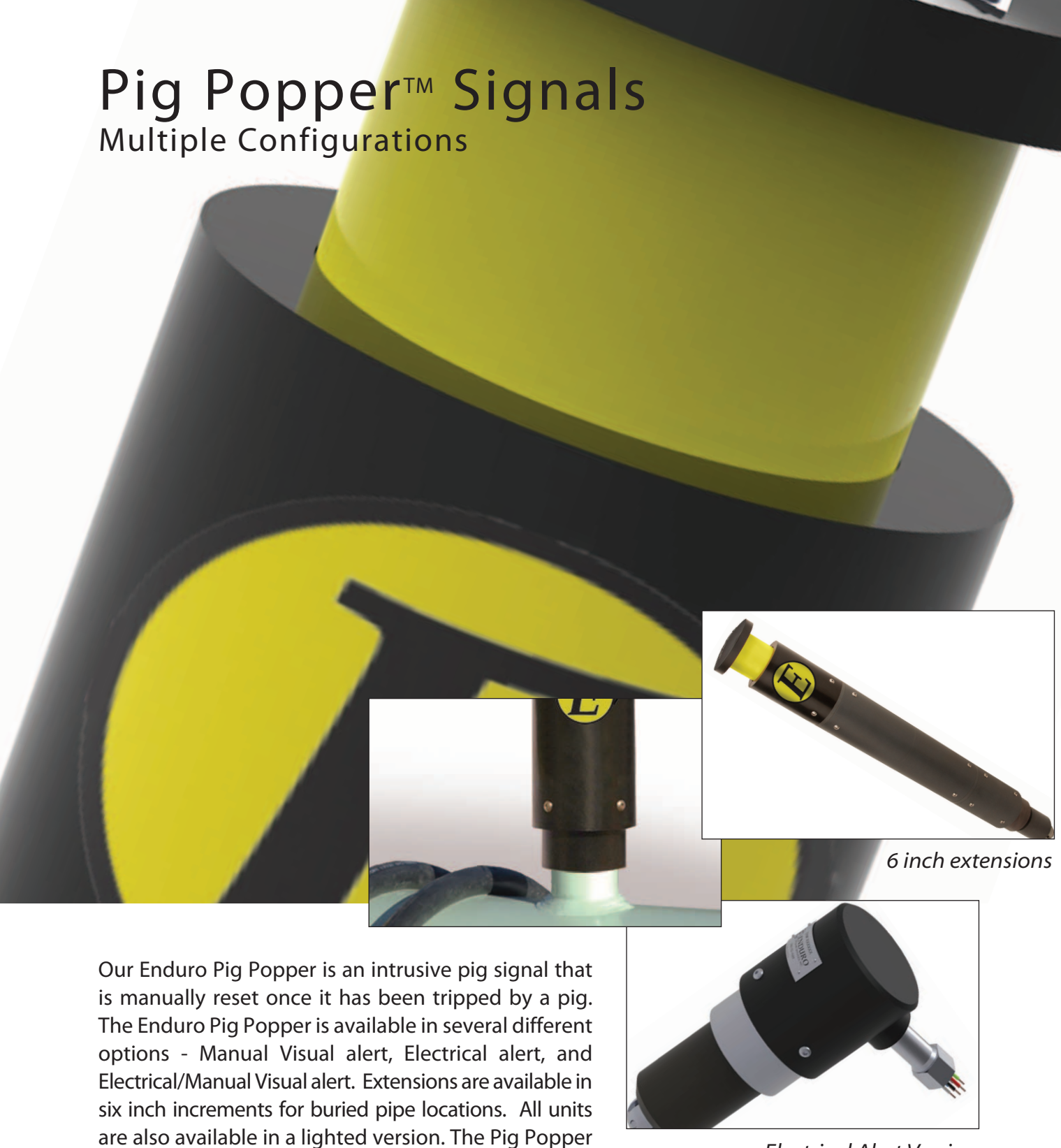
Electrical Alert Version

is designed to be fitted on most existing 2" fittings.